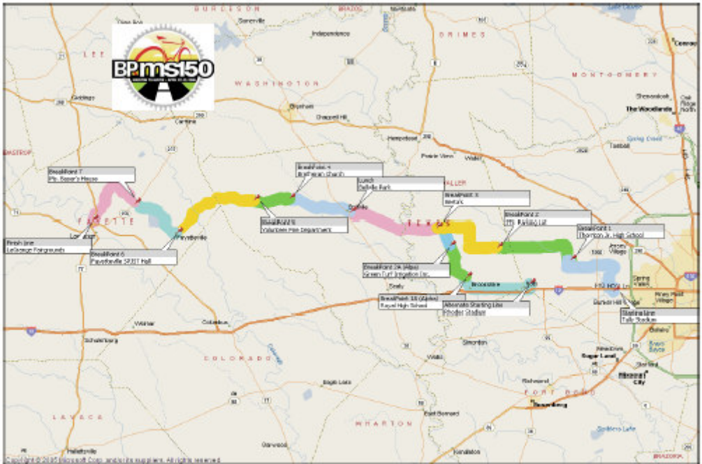
BP MS150 Bike Route - Saturday April 22, 2006