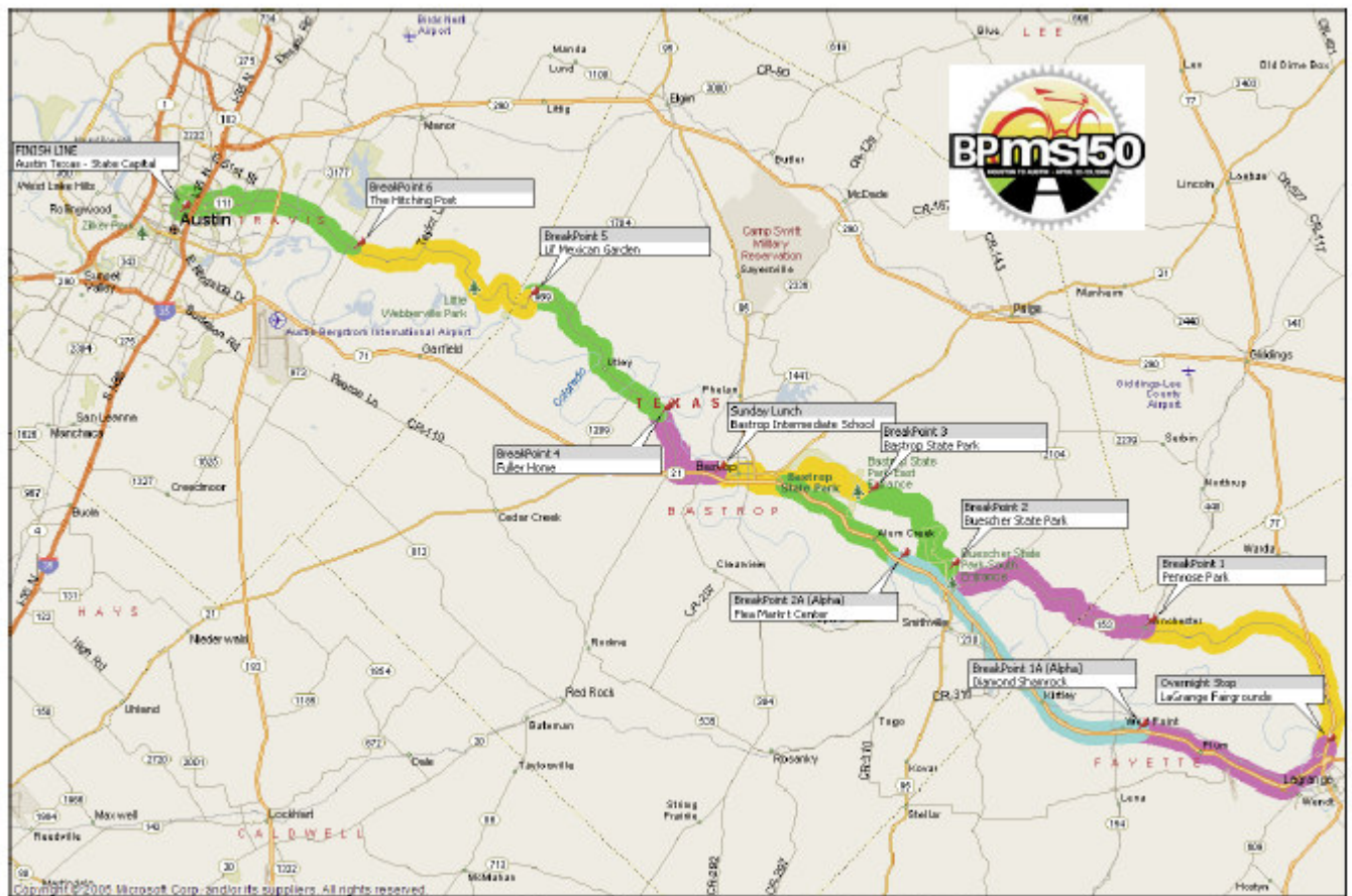
BP MS150 Bike Route - Sunday April 23, 2006